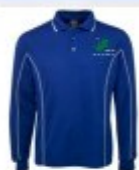
Code No: 7PIPL POLO Royal Blue / White Piping