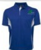
Code No: 7COP POLO Royal Blue / White & Grey Trim