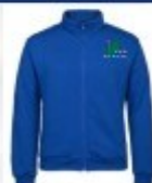
Code No: 7PFJ Fleece Jacket Colours - Royal Blue / Black / Navy