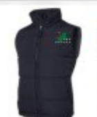
Men's Code No: 3ADV Ladies Code No: 3ADV1 Puffer Vest Colours - Navy / Grey & Black / Grey