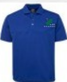
Code No: 7SPF POLO Royal Blue