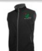
Men's Code No: 3WSV Ladies Code No: 3WSV1 Water Resistant Softshell Vest Colours - Black / Navy