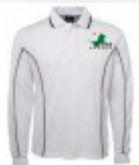
Code No: 7PIPL POLO White / Navy Piping