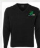
Men's Code No: 6J Ladies Code No: 6J1 Knitted V Neck Jumper Colours - Black / Charcoal / Navy