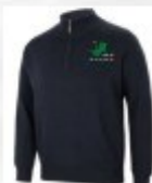
Code No: 6JHZ Zip, classic knitted Jumper Colours - Black / Charcoal / Navy