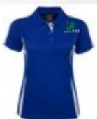
Ladies Cool POLO Ladies Code No: 2309 Royal Blue / White & Grey trim