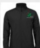
Men's Code No: 3WSJ Ladies Code No: 3WSJ1 Water Resistant Softshell Jacket. Colours - Black / Navy / Royal Blue