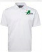
Code No: 7SPF POLO White