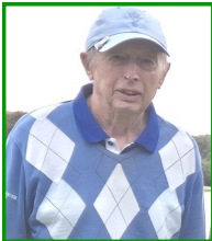
2026 MPVGA Life Member & Portsea Delegate