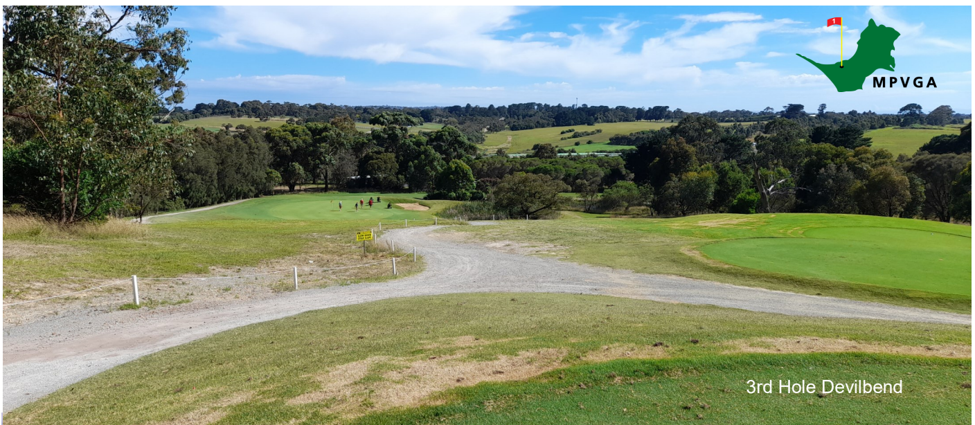
3rd Hole Devilbend