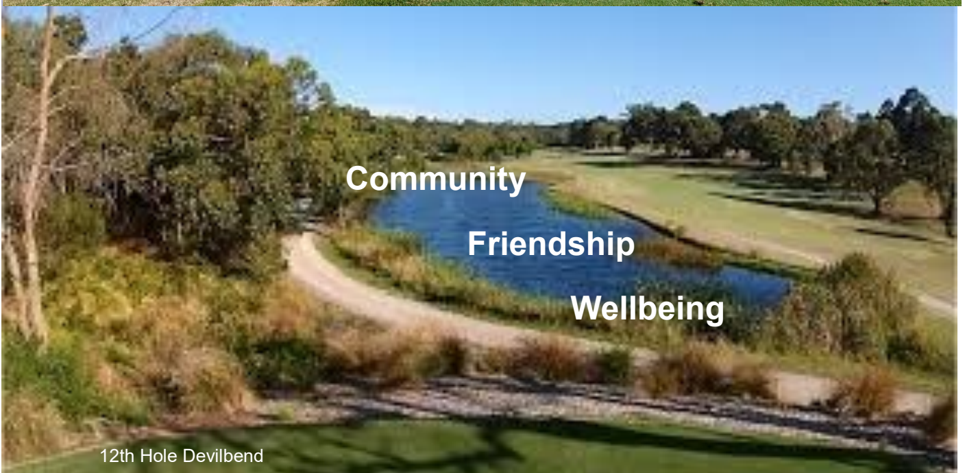
12th Hole Devilbend