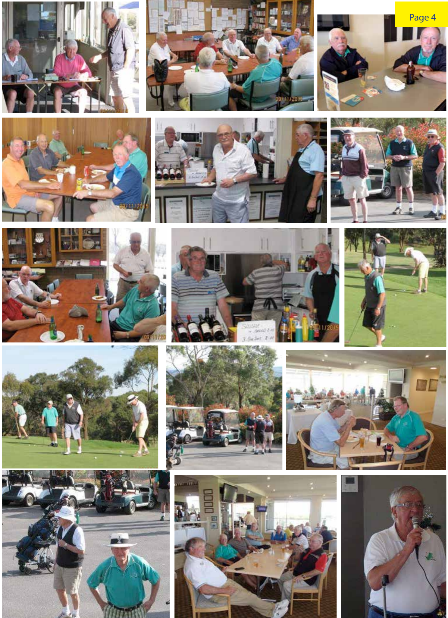
Pics from The Dunes, Mount Martha and Rosebud Park Golf Club @ Bay Views Golf Course (see note page 2).