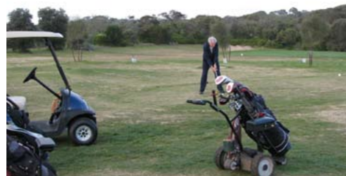
RANDOM PICS FROM THE DUNES, MOONAH, PORTSEA & CERBERUS