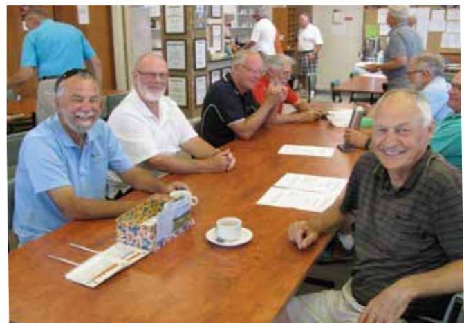
Pics from Devilbend & Mount Martha