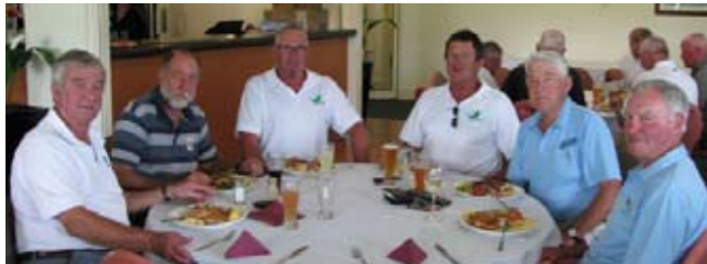
PICS FROM FLINDERS & AGM ANNUAL LUNCH AT ROSEBUD CC